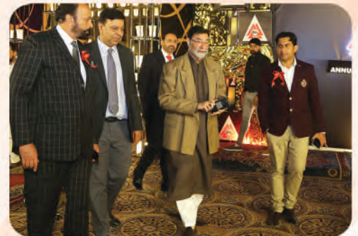
Annual Function 2025