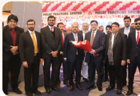
MTL at International PFA Expo 2025