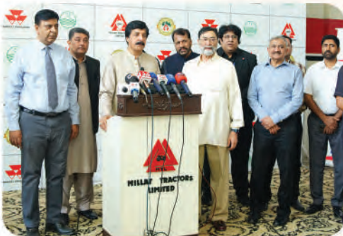
Governor Punjab visits MTL Factory